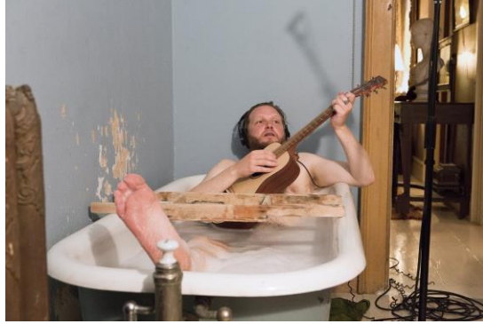
Ragnar Kjartansson, Video Still from The Visitors . 2012.